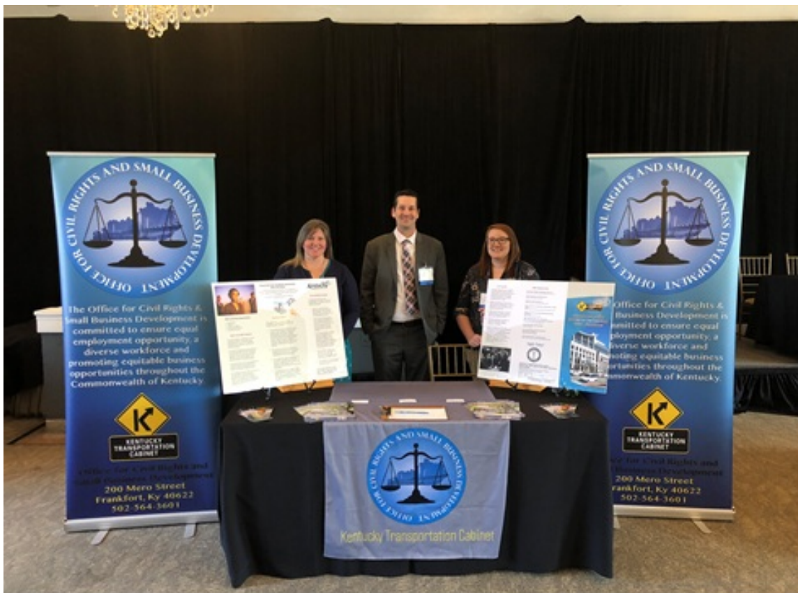
DBE Program Investigative Officers at the Joint Utility Reception in Louisville, KY